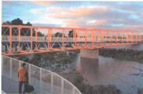
Studio Pali Fekete Architects designed a graceful 400-ton, 400-foot-long bridge. Renderings by SPF.a.

The bridge will be 400 feet long, 27 feet wide, 30 feet tall, and appear to float about 30 feet above the riverbed. That graceful illusion is backed up by 400 tons of steel and 60-foot anchors. It is scheduled to open in two years.