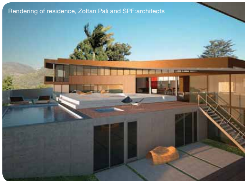
Rendering of residence, Zoltan Pali and SPF:architects

Thomas: I also have three favorite points in a design. The first is coming up with the magic sketch. The second is building up the actual technical packaging, the problem-solving aspect of the design. And my final favorite part is when I get to experience the finished product firsthand.