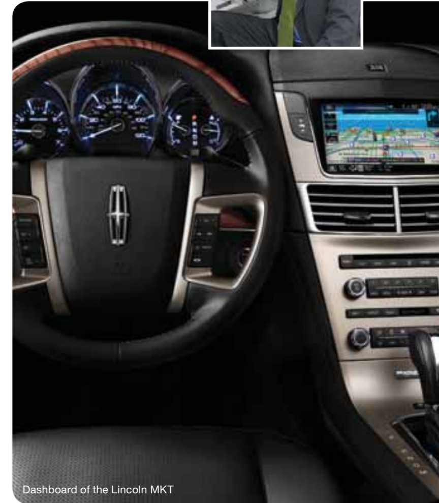
Dashboard of the Lincoln MKT