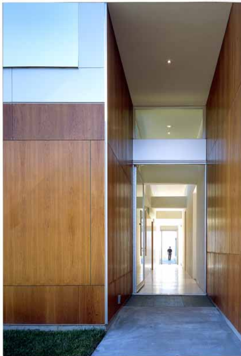
The entry hall (above and right) draws the eye through the house, culminating in a rear terrace (above right and far right) that captures views of the San Fernando Valley.