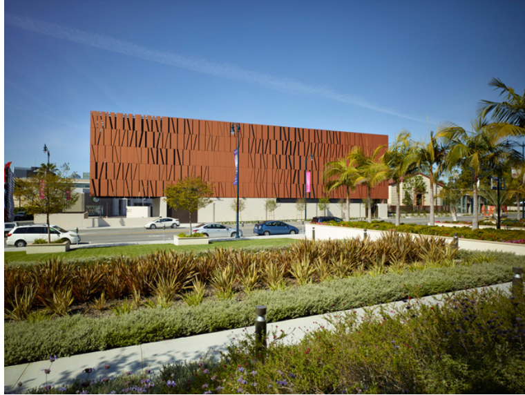
Wallis Annenberg Center - Goldsmith Theatre.

“ Since the Wallis Annenberg Center for the Performing Arts by Studio Pali Fekete Architects (SPF:a) broke ground in 2010, the new arts building continues to gain recognition, most recently at the 31st California Preservation Design Awards. Situated in the heart of sunny Beverly Hills, California, the Wallis Annenberg Center complex also includes the restored and renovated historic 1934 Beverly Hills Post Office building. — bustler.net